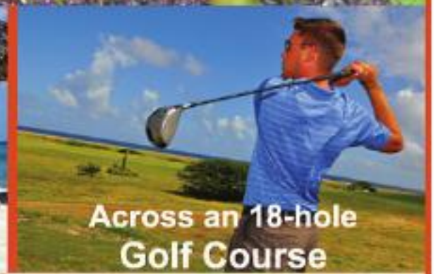
Across an 18-hole Golf Course